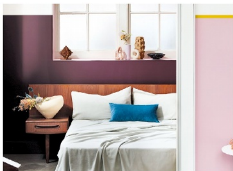
FEATURE JO BAILEY

Lick has joined forces with the team at Livingetc to create the Palette 01: Neo Deco pastels paint collection. With seven playful shades to choose from, this range is the perfect blend of both brands' love of being creative with colour. The hues have been designed to work harmoniously together, yet pack just as much punch on their own. We predict Purple 03, with its rich burgundy tones, will be a must-have for the season. Lick x Livingetc Collection, £38 for 2.5ltr, Lick.